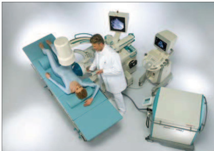
Fig. 1-1 and 1-2: The Piezolith 3000 “Triple Focus” – system overview.

Over 700 Piezolith systems sold worldwide and a high level of user satisfaction bear an impressive testimony to the excellent performance of these units. The cornerstone for this sustained period of success