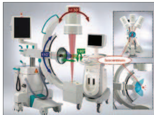
Fig. 2: The dual-simultaneous-realtime localization (DSR).

visualized at any time without any reconfiguration measures: dual, simultaneous and realtime. Fig. 3 shows a cross-section through a piezoelectric shockwave transducer in Double-Layer Technology (DLT). The principle of direct focusing means that the sound pulse emitted from the transducer surface is focused directly into the target area as a result of the spherical geometry of the therapy head. No